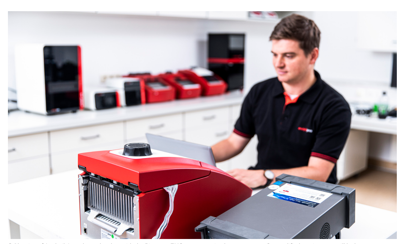
Calibration of Analytik Jena thermal cyclers with the Biometra TMS ensures optimal measurement. Our qualified service team will be happy to support you.