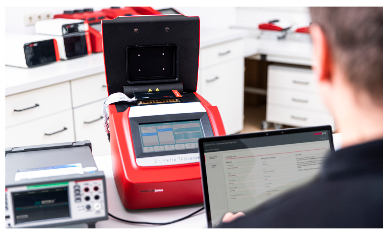
Excellent thermal cycler temperature management meets high-end temperature calibration - the best you can do for your samples!

The measurement results are presented in a meaningful report and issued with a calibration certificate. This means that you have all the relevant data for ISO-compliant documentation at hand.